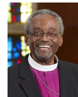
BISHOP MICHAEL CURRY